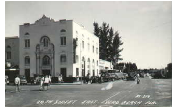
Looking east on 20 th Street at 14 th Ave